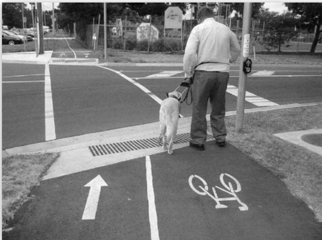
Figure 2. Advisory painted lines can divide a path into widths not adequate for both users on each side. Sides can also be misinterpreted as ‘territory’.

sensible codes of conduct already in widespread use, and the effective practice of centre-line marking with “keep left” and similar stencils’ [4]. Such advisory line markings and signage can create assumptions of ‘territory’ among users, which can expose vision-impaired pedestrians to greater risk if they should stray onto the wrong side. Figure 2 demonstrates why keeping left of a painted line may not be possible.