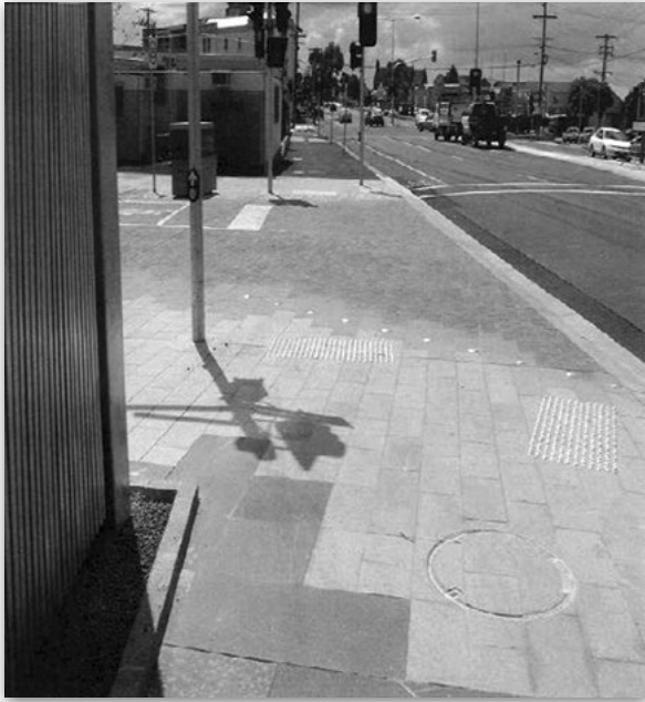
Figure 1. The shared zone pedestrian and vehicle entrance to a train station.

The modern project shown at Figure 1 is the vehicle and pedestrian entrance to a city’s central train station. The silver discs are in lieu of a curb edge, silver TGSIs laid in grey paving blocks have low contrast and the traffic light pedestrian crossing is not defined by painted lines. Random colours of pavers were used for ‘aesthetics’ throughout the precinct.