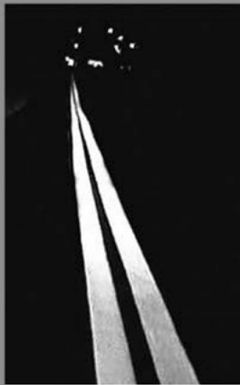
Dry night Both small beads and Visimax™ glass beads are visible

Conventional painted pavement marking systems simply aren't up to the job in wet night-time conditions.